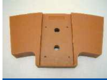
Middle shovel (RWEV)