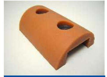
Wear shell (RWEV)