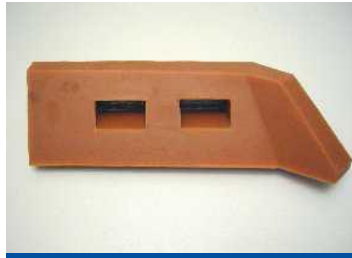
Outer shovel (RWEV)